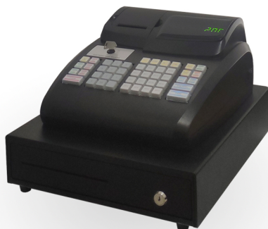
MODEL 5 COMPACT CASH DRAWER