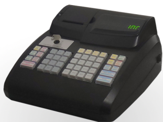
MODEL 4 NO CASH DRAWER

Works straight from the box without the need for any complicated programming, or can be programmed via software with your own detail