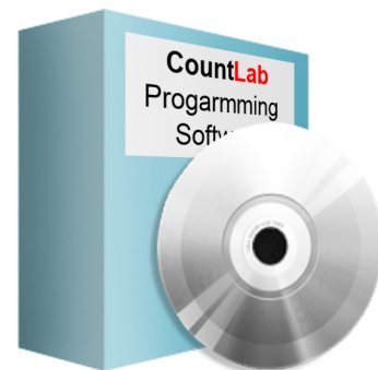
PC PROGRAMMING SOFTWARE